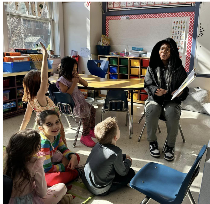
A Lugo-McGinness Academy student reads to Venable Elementary students.