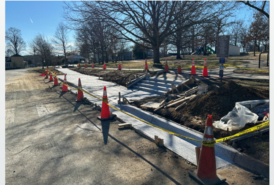
Belmont Park – DONE Midway Manor – NEXT!