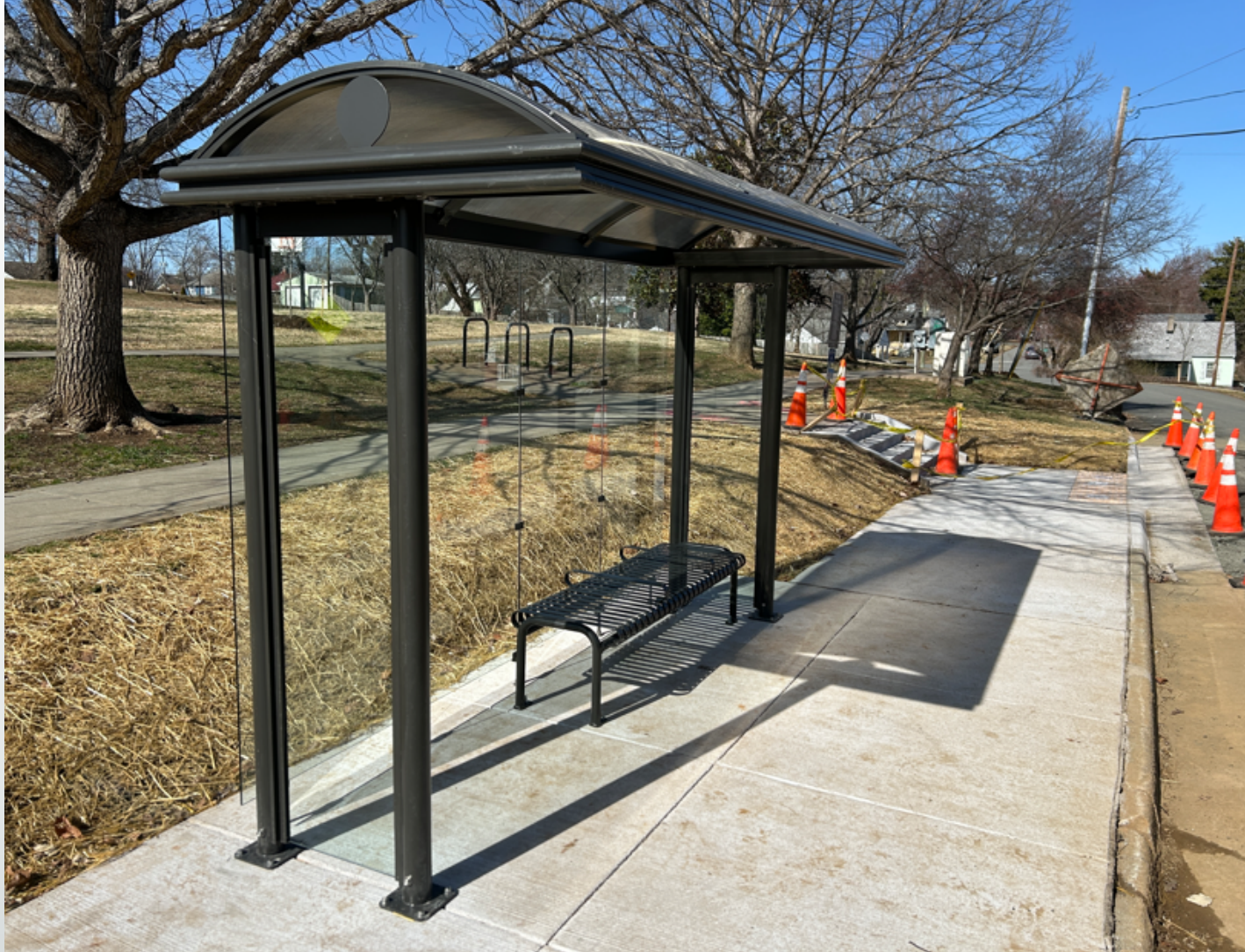
CAT Bus Shelter PROGRESS!