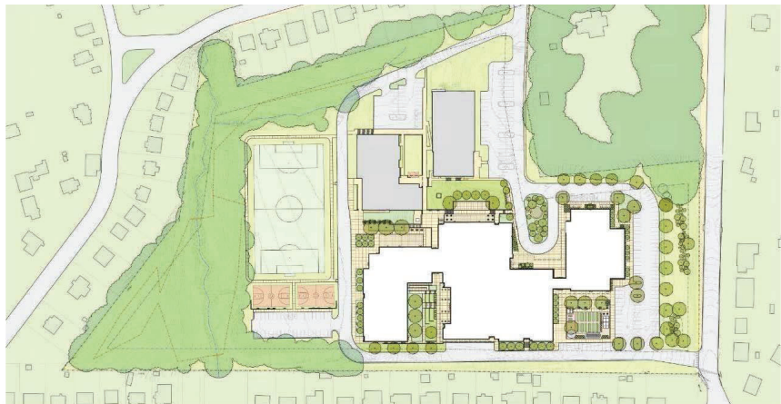
Site Plan – Schematic Design Base Estimate