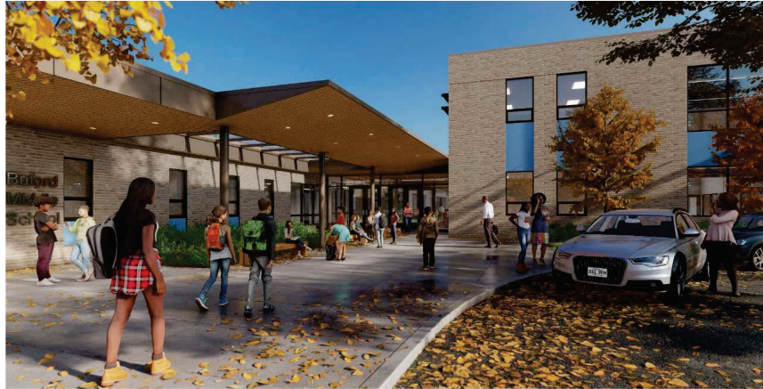
Schematic Design – Main Entrance View