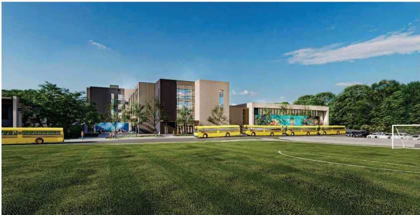
Schematic Design – Field View