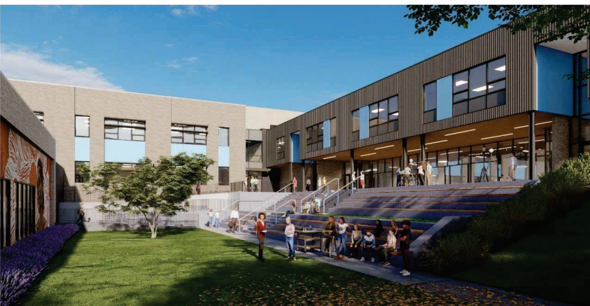
Schematic Design – Dining Terrace (Base Estimate)