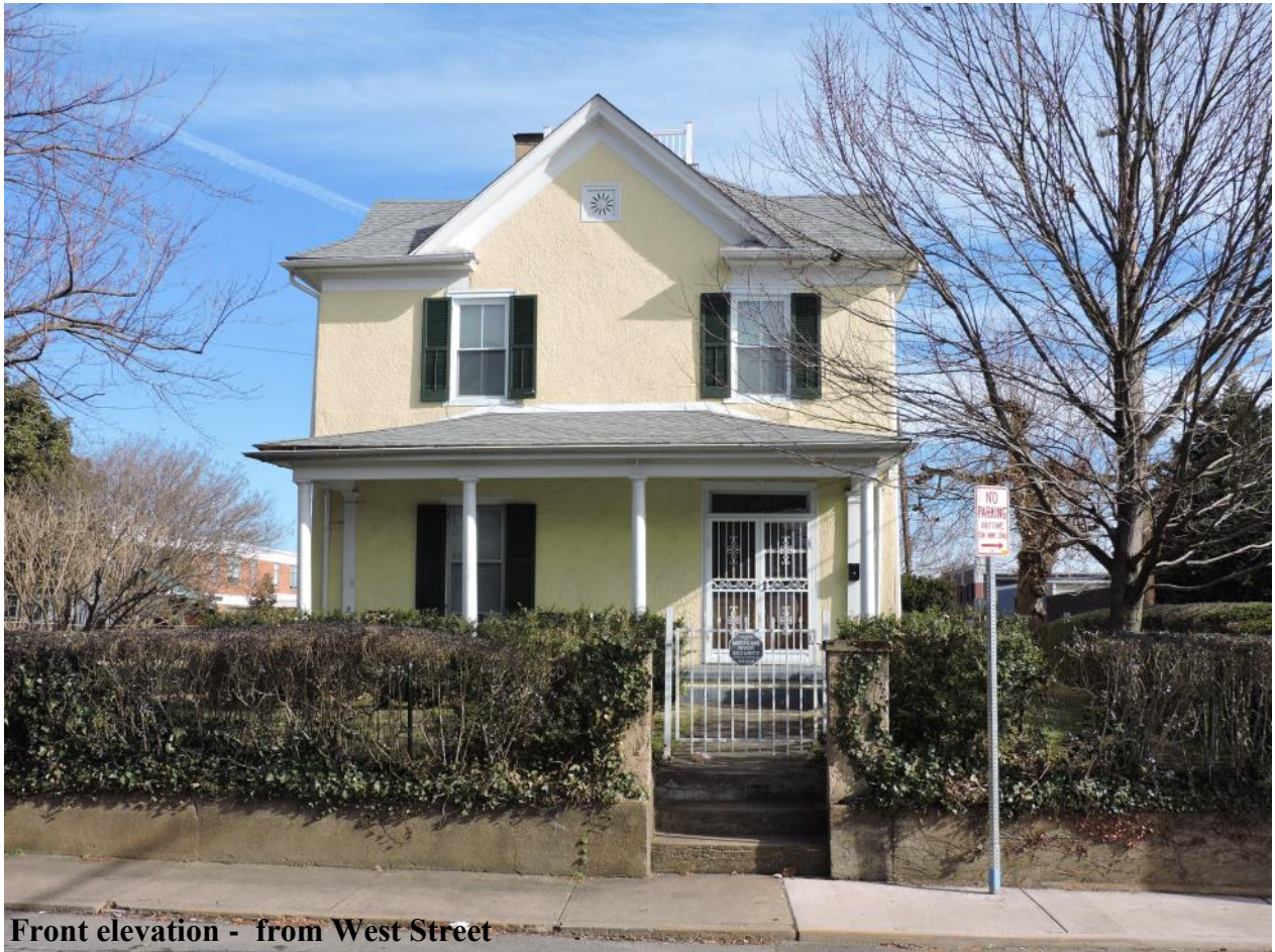
Front elevation - from West Street