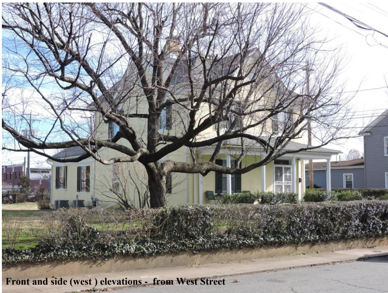
Front and side (west ) elevations - from West Street