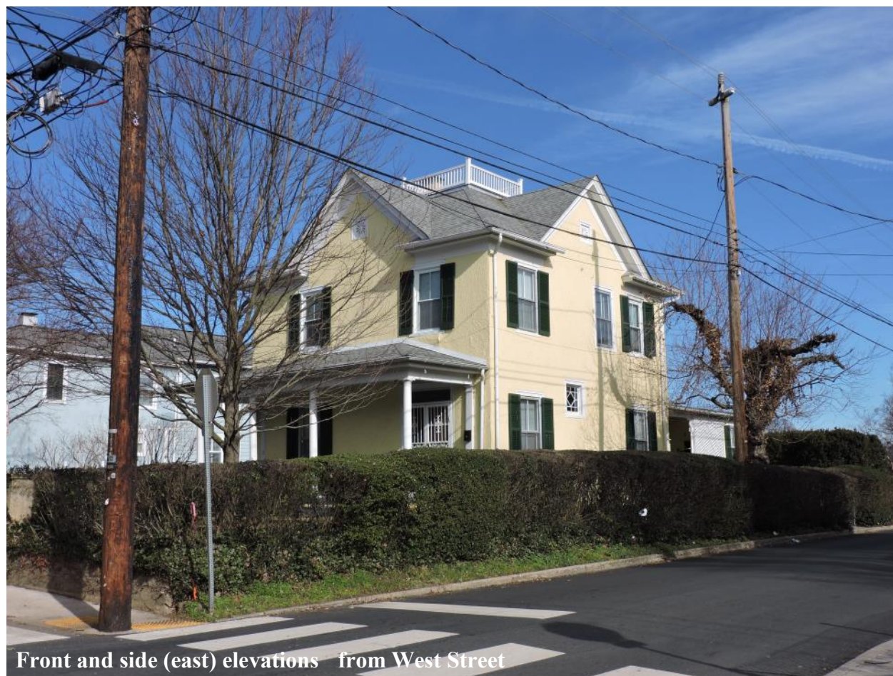
Front and side (east) elevations from West Street