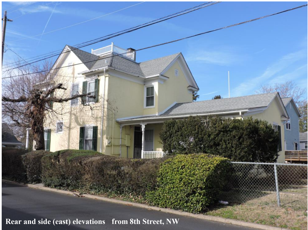
Rear and side (east) elevations from 8th Street, NW